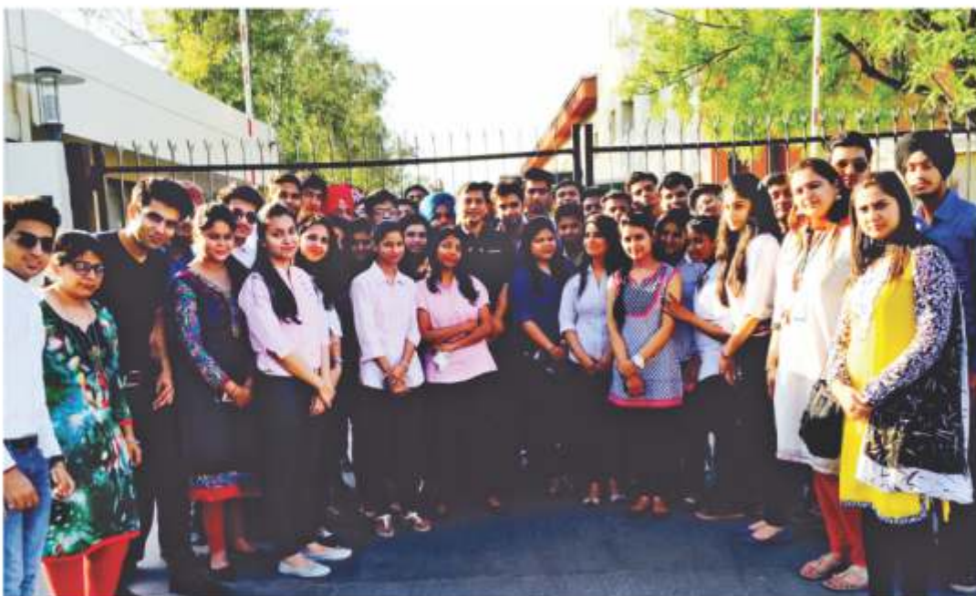
BVUSDE BCA students at Times of India press located at Sahibabad

introduced to the rolling section, where the newspaper was being rolled by the machines to stretch in two size, first 5.5 inches of full length paper and 27.5 inches for a half. Newspaper cost is affected by the width of columns per page which can be 6, 8 or 9 of the newspaper. To conclude the visit, BVUSDE students have realized that "There is no end to education. It is not that one read's a book, pass on examination & finish with education. The whole of life till the moment you die, is a process of learning". If students have tendency to learn, there is always a chance of excellence in our life. Let's not try and become perfect rather be the best learner and listener in life. If one has to achieve day dreams as true.