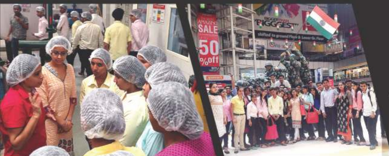
Students of BYUSDE observing Manufacturing Process Presentation