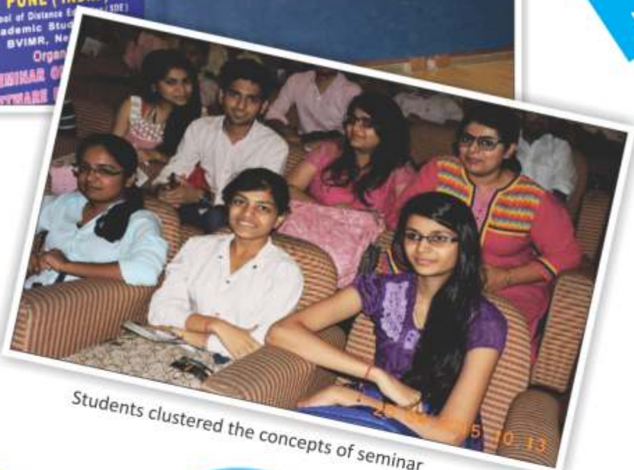
Students clustered the concepts of seminar