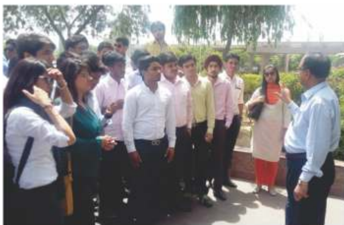
BVUSDE Students Visited Amul Plant Dairy At Manesar, Haryana

Amul is an Indian dairy cooperative, based at Anand in the state of Gujarat, India. The word Amul is derived from the Sanskrit word amulya, meaning rare, valuable. The co-operative was initially referred to as Anand Milk Federation Union Ltd. hence named as Amul.