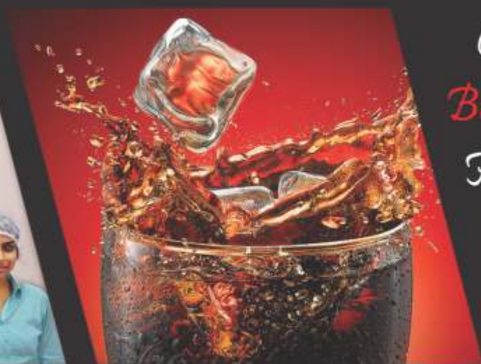
Coke Bottling Plant