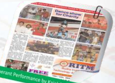
Exuberant Performance by Kajal Group for a cause