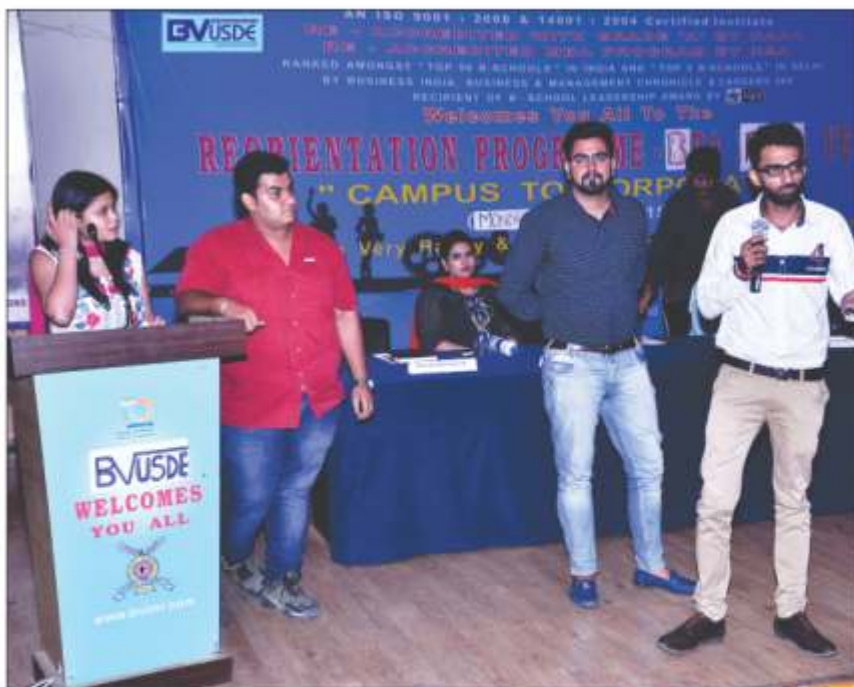
Senior's sharing their journey of success which was enhanced by the college

This event could not be possible without the efforts and hard work of the student co-ordinators who not only managed the things, but also helped in organizing the entire program they were the only reason which made this event a grand success.