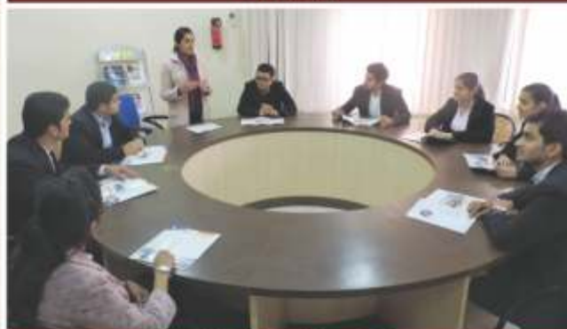
Faculty Reading Room