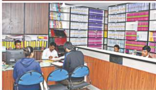
Students Support Cell