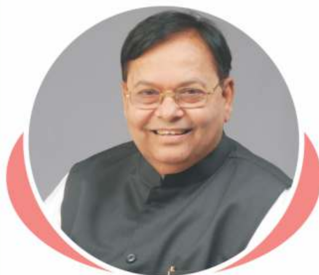
Hon'ble Dr. Patangrao Kadam

We foster a holistic culture that values the individuality of each student, hone their academic skills, fine their aesthetic senses and encourage them to explore revel in the joy learning.