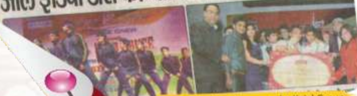
Phenomenal performance by Kajal Group at "All India Dance Show"