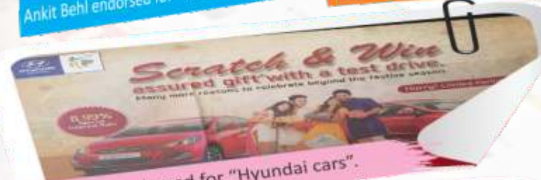
Ankit Behl endorsed for "Hyundai cars".