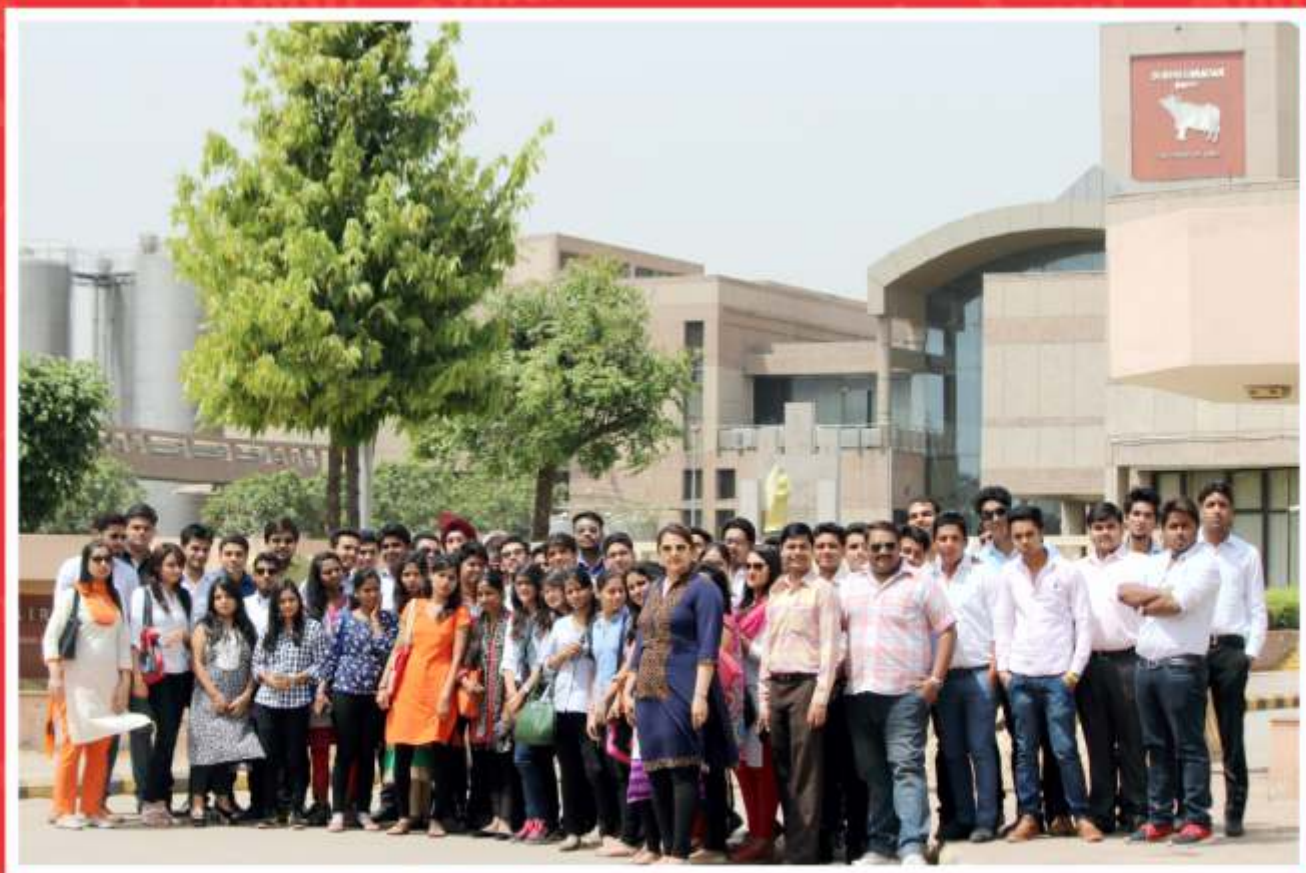
BVUSDE Students Visited Amul Plant Dairy At Manesar, Haryana